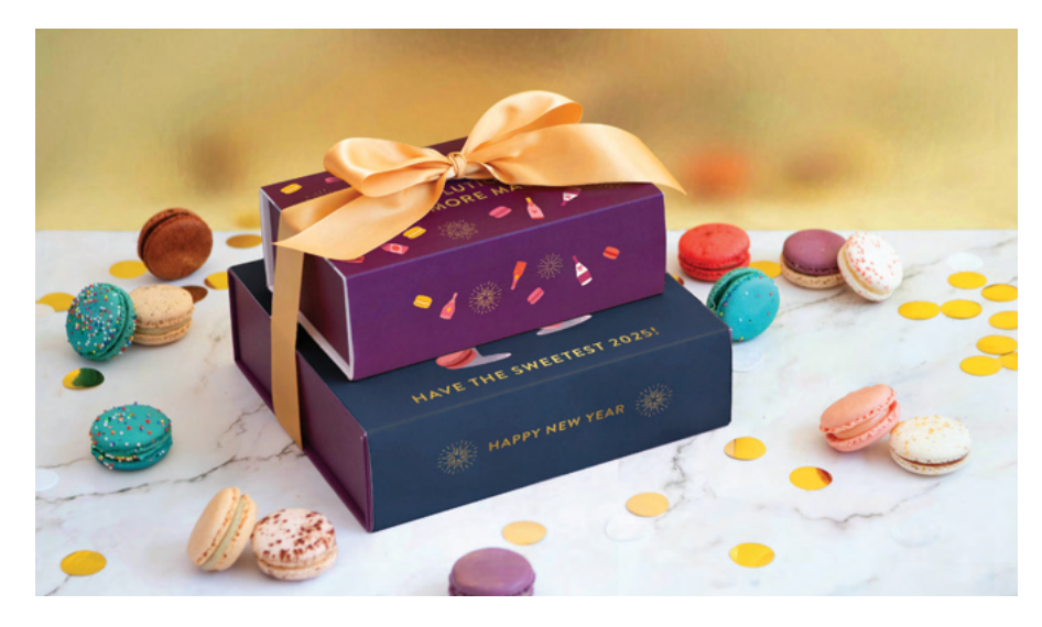
MAC-NIFICENT NEW YEAR STACK Tasting Box of 18 macarons and box of 9 macarons.

All of our classic and seasonal flavors.