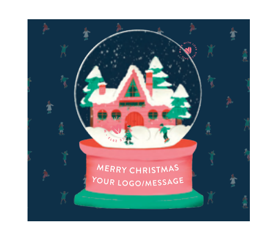
Sweet Snow Globe