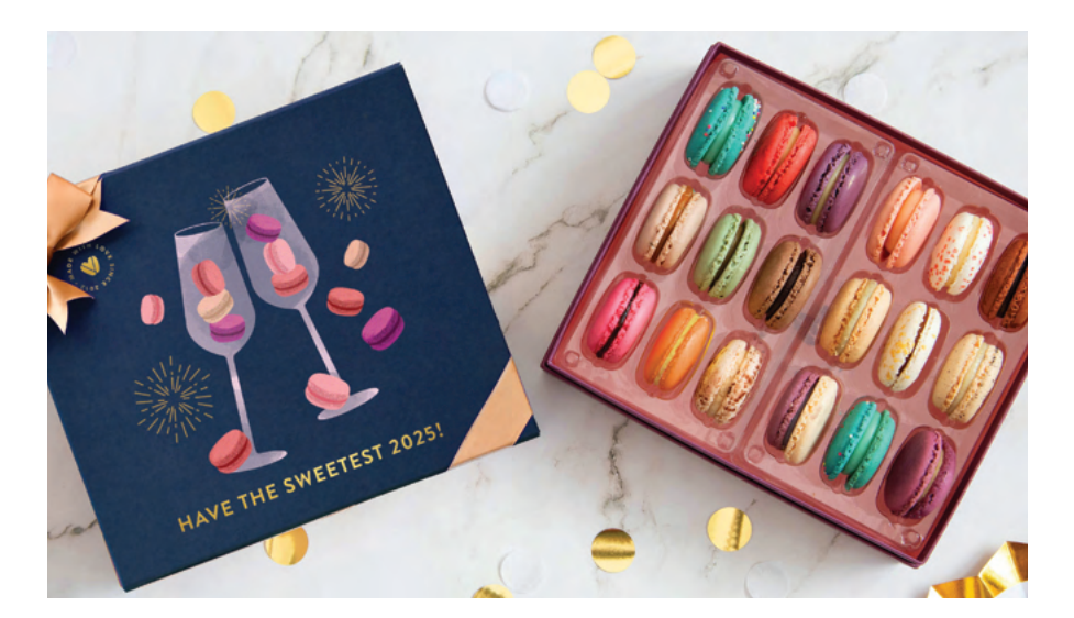
FUNKY NEW YEAR TASTING BOX

All of our classic and seasonal flavors.