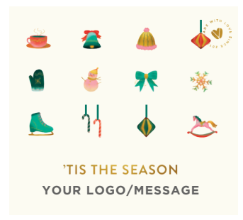
'Tis The Season