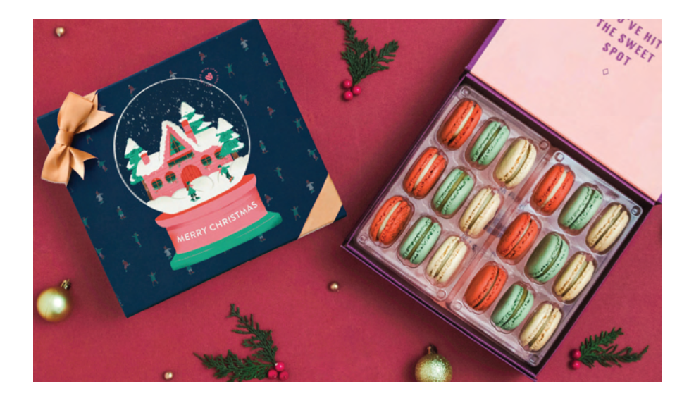
MERRY CHRISTMAS Sicilian Pistachio, Red Velvet, and Classic Vanilla.