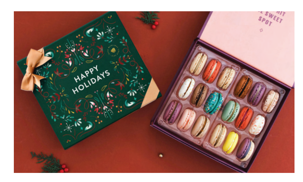
SWEET HOLIDAYS TASTING BOX

All of our classic and seasonal flavors.